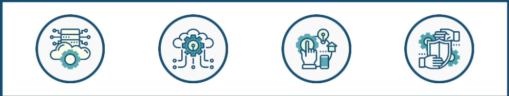
Figure of merits: Empower edge, End-to-end distributed architecture, Infrastructure robustness